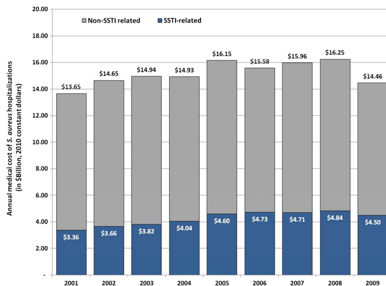
Figure 3 Annual medical associated cost of S. aureus hospitalizations and role of skin and soft tissue infections (SSTIs) in U.S.A., 2001–2009.

The observed temporal variations in national costs were driven by a number of factors that acted in different directions. First, average length of stay and the average cost of hospitalization for S. aureus associated SSTIs decreased. This trend was counterbalanced by the higher incidence of S. aureus -SSTI hospitalizations. Table 2 describes these changes between 2001 and 2009 overall, and stratified by age groups. For example, between 2001 and 2009, in children 0–17 years of age, there was a reduction of 43%, in the average length of hospital stay (8.1 to 4.7 days, p < 0.05 ), and a reduction of 66% in the average cost of a hospitalization ($22,601 to $7,740, p < 0.05 ). However, these changes were counterbalanced by a 305% (11.29 to 45.74 per 100,000, p < 0.05 ) increase in hospitalization incidence. In combination, these forces